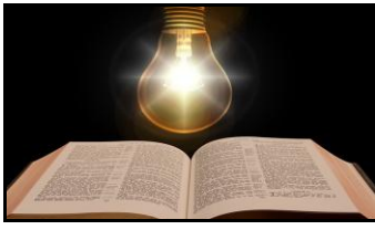
The Word of God