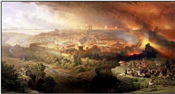
Destruction of Jerusalem in 70 AD

Hosea 4:1-7 Hear the word of the LORD, ye children of Israel: for the LORD hath a controversy with the inhabitants of the land, because there is no truth, nor mercy, nor knowledge of God in the land. (2) By swearing, and lying, and killing, and stealing, and committing adultery, they break out, and blood toucheth blood. (3) Therefore shall the land mourn, and every one that dwelleth therein shall languish, with the beasts of the field, and with the fowls of heaven; yea, the fishes of the sea also shall be taken away. (4) Yet let no man strive, nor reprove another: for thy people are as they that strive with the priest. (5) Therefore shalt thou fall in the day, and the prophet also shall fall with thee in the night, and I will destroy thy mother. (6) My people are destroyed for lack of knowledge: because thou hast rejected knowledge, I will also reject thee, that thou shalt be no priest to me: seeing thou hast forgotten the law of thy God, I will also forget thy children. (7) As they were increased, so they sinned against me: therefore will I change their glory into shame.