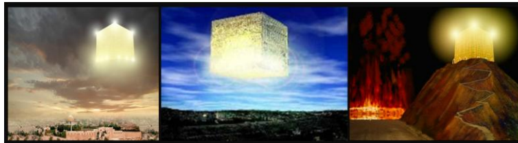
Depictions of New Jerusalem, the Kingdom of God, the Father

Prayer: Psalms 46:1-3, 5-6 God is our refuge and strength, a very present help in trouble. (2) Therefore will not we fear, though the earth be removed, and though the mountains be carried into the midst of the sea; (3) Though the waters thereof roar and be troubled, though the mountains shake with the swelling thereof. Selah. 5 God is in the midst of her; she shall not be moved: God shall help her, and that right early. (6) The heathen raged, the kingdoms were moved: he uttered his voice, the earth melted.