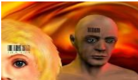
Depiction of the Mark of the Beast

Revelation 16:1-2 And I heard a great voice out of the temple saying to the seven angels, Go your ways, and pour out the vials of the wrath of God upon the earth. (2) And the first went, and poured out his vial upon the earth; and there fell a noisome and grievous sore upon the men which had the mark of the beast, and [upon] them which worshipped his image.