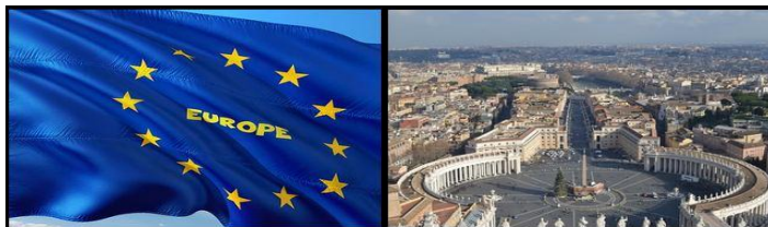
The European Union (Temporal head) & The Roman [Babylon, the great] Catholic Church (Religious head)