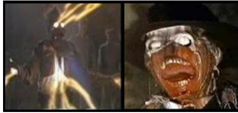
Eyes, flesh and tongue consuming away