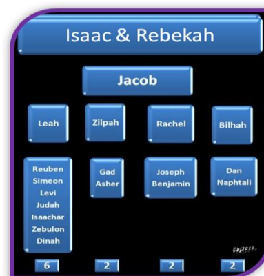
The 12 Tribes of Israel

Deuteronomy 32:8-26 When the most High divided to the nations their inheritance, when he separated the sons of Adam, he set the bounds of the people according to the number of the children of Israel. (9) For the LORD'S portion [is] his people; Jacob [is] the lot of his inheritance. (10) He found him in a desert land, and in the waste howling wilderness; he led him about, he instructed him, he kept him as the apple of his eye. (11) As an eagle stirreth up her nest, fluttereth over her young, spreadeth abroad her wings, taketh them, beareth them on her wings: (12) [So] the LORD alone did lead him, and [there was] no strange god with him. (13) He made him ride on the high places of the earth, that he might eat the increase of the fields; and he made him to suck honey out of the rock, and oil out of the flinty rock; (14) Butter of kine, and milk of sheep, with fat of lambs, and rams of the breed of Bashan,