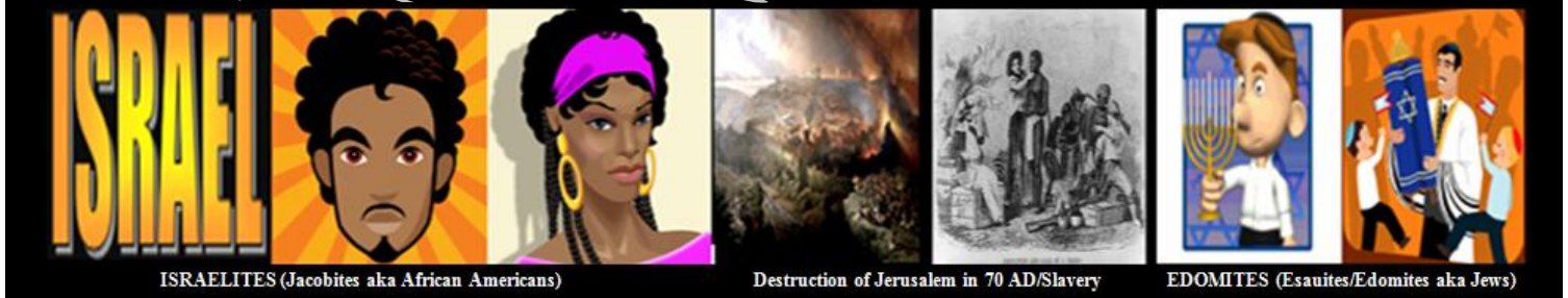
ISRAELITES (Jacobites aka African Americans)