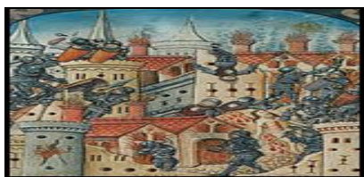
Fall of Jerusalem

Luke 19:41-44 And when he was come near, he beheld the city, and wept over it, (42) Saying, If thou hadst known, even thou, at least in this thy day, the things [which