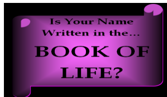
Book of Life