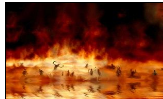
Lake of Fire

Revelation 20:7-15 And when the thousand years are expired, Satan shall be loosed out of his prison, (8) And shall go out to deceive the nations which are in the four quarters of the earth, Gog and Magog, to gather them together to battle: the number of whom is as the sand of the sea. (9) And they went up on the breadth of the earth, and compassed the camp of the saints about, and the beloved city: and fire came down from God out of heaven, and devoured them. (10) And the devil that deceived them was cast into the lake of fire and brimstone, where the beast and the false prophet are , and shall be tormented day and night for ever and ever. (11) And I saw a great white throne, and him that sat on it, from whose face the earth and the heaven fled away; and there was found no place for them. (12) And I saw the dead, small and great, stand before God; and the books were opened: and another book was opened, which is the book of life: and the dead were judged out of those things which were written in the books, according to their works. (13) And the sea gave up the dead which were in it; and death and hell delivered up the dead which were in them: and they were judged every man according to their works. (14) And death and hell were cast into the lake of fire. This is the second death. (15) And whosoever was not found written in the book of life was cast into the lake of fire.