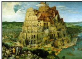
Tower of Babel

Genesis 11:1-10, 26-30 And the whole earth was of one language, and of one speech. [2] And it came to pass, as they journeyed from the east, that they found a plain in the land of Shinar; and they dwelt there. [3] And they said one to another, Go to, let us make brick, and burn them throughly. And they had brick for stone, and slime had they for mortar. [4] And they said, Go to, let us build us a city and a tower, whose top may reach unto heaven; and let us make us a name, lest we be scattered abroad upon the face of the whole earth. [5] And the LORD came down to see the city and the tower, which the children of men builded. [6] And the LORD said, Behold, the people is one, and they have all one language; and this they begin to do: and now nothing will be restrained from them, which they have imagined to do. [7] Go to, let us go down, and there confound their language, that they may not understand one another's speech. [8] So the LORD scattered them abroad from thence upon the face of all the earth: and they left off to build the city. [9] Therefore is the name of it called Babel; because the