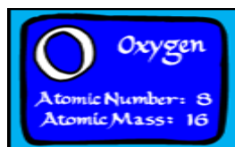
Breath of Life

Genesis 2:7-24 And the LORD God formed man of the dust of the ground, and breathed into his nostrils the breath of life; and man became a living soul. [8] And the LORD God planted a garden eastward in Eden; and there he put the man whom he had formed. [9] And out of the ground made the LORD God to grow every tree that is pleasant to the sight, and good for food; the tree of life also in the midst of the garden, and the tree of knowledge of good and evil. [10] And a river went out of Eden to water the garden; and from thence it was parted, and became into four heads. [11] The name of the first is Pison: that is it which compasseth the whole land of Havilah, where there is gold; [12] And the gold of that land is good: there is bdellium and the onyx stone. [13] And