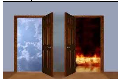
Salvation or Damnation

Matthew 7:15-16, 21-23 Beware of false prophets, which come to you in sheep's clothing, but inwardly they are ravening wolves. (16) Ye shall know them by their fruits. Do men gather grapes of thorns, or figs of thistles? 21 Not every one that saith unto me, Lord, Lord, shall enter into the kingdom of heaven; but he that doeth the will of my Father which is in heaven. (22) Many will say to me in that day, Lord, Lord, have we not prophesied in thy name? and in thy name have cast out devils? and in thy name done many wonderful works? (23) And then will I profess unto them, I never knew you: depart from me, ye that work iniquity.