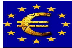
Fall of Babylon