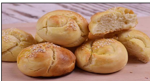
Puffed up = Old Leaven (Sin)

1 Corinthians 5:7 Purge out therefore the old leaven, that ye may be a new lump, as ye are unleavened. For even Christ our passover is sacrificed for us: (8) Therefore let us keep the feast, not with old leaven, neither with the leaven of malice and wickedness; but with the unleavened bread of sincerity and truth.