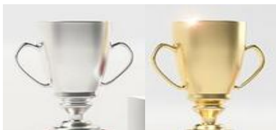
Silver & Gold Vessels

Joshua 6:1-5, 16-20 Now Jericho was straitly shut up because of the children of Israel: none went out, and none came in. (2) And the LORD said unto Joshua, See, I have given into thine hand Jericho, and the king thereof, and the mighty men of valour. (3) And ye shall compass the city, all ye men of war, and go round about the city once. Thus shalt thou do six days. (4) And seven priests shall bear before the ark seven trumpets of