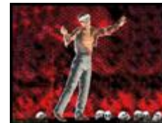
Eternal Death awaits the Wicked

rams' horns: and the seventh day ye shall compass the city seven times, and the priests shall blow with the trumpets. (5) And it shall come to pass, that when they make a long blast with the ram's horn, and when ye hear the sound of the trumpet, all the people shall shout with a great shout; and the wall of the city shall fall down flat, and the people shall ascend up every man straight before him. 16 And it came to pass at the seventh time, when the priests blew with the trumpets, Joshua said unto the people, Shout; for the LORD hath given you the city. (17) And the city shall be accursed, even it, and all that are therein, to the LORD: only Rahab the harlot shall live, she and all that are with her in the house, because she hid the messengers that we sent. (18) And ye, in any wise keep yourselves from the accursed thing, lest ye make yourselves accursed, when ye take of the accursed thing, and make the camp of Israel a curse, and trouble it. (19) But all the silver, and gold, and vessels of brass and iron, are consecrated unto the LORD: they shall come into the treasury of the LORD. (20) So the people shouted when the priests blew with the trumpets: and it came to pass, when the people heard the sound of the trumpet, and the people shouted with a great shout, that the wall fell down flat, so that the people went up into the city, every man straight before him, and they took the city.