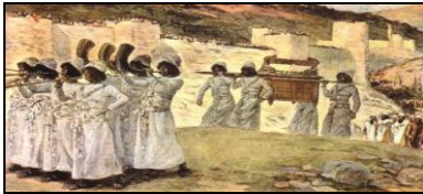
Ark of the Covenant

1 Samuel 4:1-2, 4, 10-12, 16-22 And the word of Samuel came to all Israel. Now Israel went out against the Philistines to battle, and pitched beside Ebenezer: and the Philistines pitched in Aphek. (2) And the Philistines put themselves in array against Israel: and when they joined battle, Israel was smitten before the Philistines: and they slew of the army in the field about four thousand men. [4] So the people sent to Shiloh, that they might bring from thence the ark of the covenant of the LORD of hosts, which dwelleth between the cherubims: and the two sons of Eli, Hophni and Phinehas, were there with the ark of the covenant of God. [10] And the Philistines fought, and Israel was smitten, and they fled every man into his tent: and there was a very great slaughter; for there fell