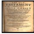
The Prophets &amp; The Apostles

Ephesians 2:11-14, 18-20 Wherefore remember, that ye [being] in time past Gentiles in the flesh, who are called Uncircumcision by that which is called the Circumcision in the flesh made by hands; (12) That at that time ye were without Christ, being aliens from the commonwealth of Israel, and strangers from the covenants of promise, having no hope, and without God in the world: (13) But now in Christ Jesus ye who sometimes were far off are made nigh by the blood of Christ. (14) For he is our peace, who hath made both one, and hath broken down the middle wall of partition [between us]; [18] For through him we both have access by one Spirit unto the Father. (19) Now therefore ye are no more strangers and foreigners, but fellowcitizens with the saints, and of the household of God; (20) And are built upon the foundation of the apostles and prophets, Jesus Christ himself being the chief corner [stone];