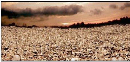
Valley of Dry Bones

Prayer: Psalms 36:5-10 Thy mercy, O LORD, is in the heavens; and thy faithfulness reacheth unto the clouds. Thy righteousness is like the great mountains; thy judgments are a great deep: O LORD, thou preservest man and beast. How excellent is thy lovingkindness, O God! therefore the children of men put their trust under the shadow of thy wings. They shall be abundantly satisfied with the fatness of thy house; and thou shalt make them drink of the river of thy pleasures. For with thee is the fountain of life: in thy light shall we see light. O continue thy lovingkindness unto them that know thee; and thy righteousness to the upright in heart.