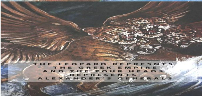
THE LEOPARD REPRESENTS THE GREEK EMPIRE AND THE FOUR HEADS REPRESENTS ALEXANDER'S GENERALS