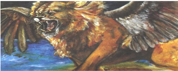
THE LION REPRESENTS THE BABYLON EMPIRE