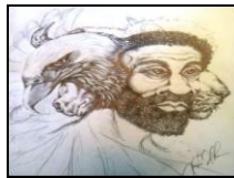
Depiction of a Cherub Angel

Isaiah 63:7-9 I will mention the lovingkindnesses of the LORD, [and] the praises of the LORD, according to all that the LORD hath bestowed on us, and the great goodness toward the house of Israel, which he hath bestowed on them according to his mercies, and according to the multitude of his lovingkindnesses. (8) For he said, Surely they [are] my people, children [that] will not lie: so he was their Saviour. (9) In all their affliction he was afflicted, and the angel of his presence saved them: in his love and in his pity he redeemed them; and he bare them, and carried them all the days of old.