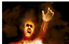
Rich Man in the Lake of Fire

Luke 16:19-31 There was a certain rich man, which was clothed in purple and fine linen, and fared sumptuously every day: (20) And there was a certain beggar named Lazarus, which was laid at his gate, full of sores, (21) And desiring to be fed with the crumbs which fell from the rich man's table: moreover the dogs came and licked his sores. (22) And it came to pass, that the beggar died, and was carried by the angels into Abraham's bosom: the rich man also died, and was buried; (23) And in hell he lift up his eyes, being in torments, and seeth Abraham afar off, and Lazarus in his bosom. (24) And he cried and said, Father Abraham, have mercy on me, and send Lazarus, that he may dip the tip of his finger in water, and cool my tongue; for I am tormented in this flame. (25) But Abraham said, Son, remember that thou in thy lifetime receivedst thy good things, and likewise Lazarus evil things: but