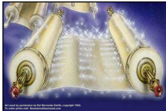
Depiction of the Book of Life

Art used by permission of Pat Marvenko Smith, copyright 1992. To order prints visit her "Revelation Illustrated" site, http://revelationillustrated.com .