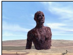
Returning to Dust

Ecclesiastes 3:18-22 I said in mine heart concerning the estate of the sons of men, that God might manifest them, and that they might see that they themselves are beasts. (19) For that which befalleth the sons of men befalleth beasts; even one thing befalleth them: as the one dieth, so dieth the other; yea, they have all one breath; so that a man hath no preeminence above a beast: for all is vanity. (20) All go unto one place; all are of the dust, and all turn to dust again. (21) Who knoweth the spirit of man that goeth upward, and the spirit of the beast that goeth downward to the earth? (22) Wherefore I perceive that there is nothing better, than that a man should rejoice in his own works; for that is his portion: for who shall bring him to see what shall be after him?