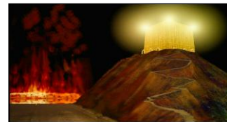
Depiction of the Lake of fire & New Jerusalem

Revelation 21:7-8 He that overcometh shall inherit all things; and I will be his God, and he shall be my son. (8) But the fearful, and unbelieving, and the abominable, and murderers, and whoremongers, and sorcerers, and idolaters, and all liars, shall have their part in the lake which burneth with fire and brimstone: which is the second death.