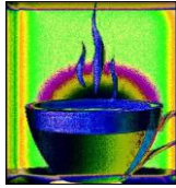
Cup of fury