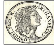
Depiction of Artaxerxes

Ezra 7:1, 6-17, 20-21, 26 Now after these things, in the reign of Artaxerxes king of Persia, Ezra the son of Seraiah, the son of Azariah, the son of Hilkiah, [6] This Ezra went up from Babylon; and he was a ready scribe in the law of Moses, which the LORD God of Israel had given: and the king granted him all his request, according to the hand of the LORD his God upon him. (7) And there went up some of the children of Israel, and of the priests, and the Levites, and the singers, and the porters, and the Nethinims, unto Jerusalem, in the seventh year of Artaxerxes the king. (8) And he came to Jerusalem in the fifth month, which was in the seventh year of the king. (9) For upon the first day of the first month began he to go up from Babylon, and on the first day of the fifth month came he to Jerusalem, according to the good hand of his God upon him. (10) For Ezra had prepared his heart to seek the law of the LORD, and to do it, and to teach in Israel statutes and judgments. (11) Now this is the copy of the letter that the king Artaxerxes gave unto Ezra the priest, the scribe, even a scribe of the words of the commandments of the LORD, and of his statutes to Israel. (12) Artaxerxes, king of kings, unto Ezra the priest, a scribe of the law of the God of heaven, perfect peace, and at such a time. (13) I make a decree, that all they of the people of