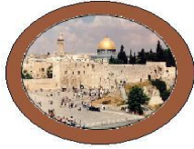
Trench around Jerusalem

Luke 19:41-44 And when he was come near, he beheld the city, and wept over it, (42) Saying, If thou hadst known, even thou, at least in this thy day, the things which belong unto thy peace! but now they are hid from thine eyes. (43) For the days shall come upon thee, that thine enemies shall cast a trench about thee, and compass thee round, and keep thee in on every side, (44) And shall lay thee even with the ground, and thy children within thee; and they shall not leave in thee one stone upon another; because thou knewest not the time of thy visitation.