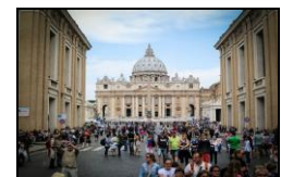
The European Union's Parliament & The Vatican

Revelation 13:1-4 And I stood upon the sand of the sea, and saw a beast rise up out of the sea, having seven heads and ten horns, and upon his