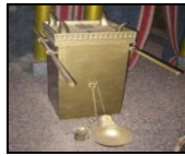
Altar of Incense

Prayer: Psalms 18:1-4 To the chief Musician, A Psalm of David, the servant of the LORD, who spake unto the LORD the words of this song in the day that the LORD delivered him from the hand of all his enemies, and from the hand of Saul: And he said, I will love thee, O LORD, my strength. (2) The LORD is my rock, and my fortress, and my deliverer; my God, my strength, in whom I will trust; my buckler, and the horn of my salvation, and my high tower. (3) I will call upon the LORD, who is worthy to be praised: so shall I be saved from mine enemies. (4) The sorrows of death compassed me, and the floods of ungodly men made me afraid.