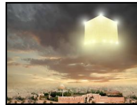
Treasures in Heaven