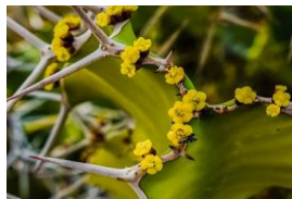
Seeds Sown Among Thorns

Mark 4:18-19 And these are they which are sown among thorns; such as hear the word, (19) And the cares of this world, and the deceitfulness of riches, and the lusts of other things entering in, choke the word, and it becometh unfruitful.