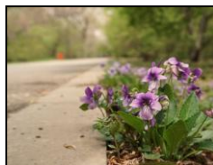
Seeds by the Way Side

Mark 4:15 And these are they by the way side, where the word is sown; but when they have heard, Satan cometh immediately, and taketh away the word that was sown in their hearts.