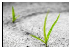
Seeds on Stony Ground

Mark 4:16-17 And these are they likewise which are sown on stony ground; who, when they have heard the word, immediately receive it with gladness; (17) And have no root in themselves, and so endure but for a time: afterward, when affliction or persecution ariseth for the word's sake, immediately they are offended.