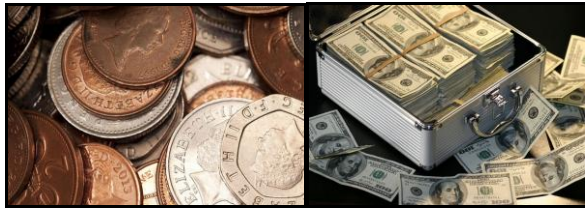
Treasures in Earth (Mammon/Money)