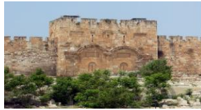
Golden (East) Gate in Jerusalem