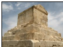
Cyrus, the great's Tomb

Ezra 2:1, 64 Now these are the children of the province that went up out of the captivity, of those which had been carried away, whom Nebuchadnezzar the king of Babylon had carried away unto Babylon, and came again unto Jerusalem and Judah, every one unto his city; [64] The whole congregation together was forty and two thousand three hundred and threescore,