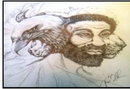
Depiction of a Cherub Angel

Haggai 2:1-5 In the seventh month , in the one and twentieth day of the month, came the word of the LORD by the prophet Haggai, saying, (2) Speak now to Zerubbabel the son of Shealtiel, governor of Judah, and to Joshua the son of Josedech, the high priest, and to the residue of the people, saying, (3) Who is left among you that saw this house in her first glory? and how do ye see it now? is it not in your eyes in comparison of it as nothing? (4) Yet now be strong, O Zerubbabel, saith the LORD; and be strong, O Joshua, son of Josedech, the high priest; and be strong, all ye people of the land, saith the LORD, and work: for I am with you, saith the LORD of hosts: (5) According to the word that I covenanted with you when ye came out of Egypt, so my spirit remaineth among you: fear ye not.