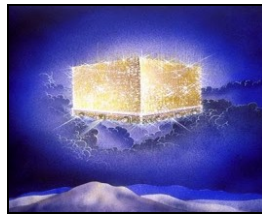
Depiction of New Jerusalem Coming Down From Heaven

Prayer: Psalms 37:1-9 Fret not thyself because of evildoers, neither be thou envious against the workers of iniquity. (2) For they shall soon be cut down like the grass, and wither as the green herb. (3) Trust in the LORD, and do good; so shalt thou dwell in the land, and verily thou shalt be fed. (4) Delight thyself also in the LORD; and he shall give thee the desires of thine heart. (5) Commit thy way unto the LORD; trust also in him; and he shall bring it to pass. (6) And he shall bring forth thy righteousness as the light, and thy judgment as the noonday. (7) Rest in the LORD, and wait patiently for him: fret not thyself because of him who prospereth in his way, because of the man who bringeth wicked devices to pass. (8) Cease from anger, and forsake wrath: fret not thyself in any wise to do evil. (9) For evildoers shall be cut off: but those that wait upon the LORD, they shall inherit the earth.