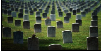
Man's Homecoming/Long Home

Ecclesiastes 12:1, 5, 7 Remember now thy Creator in the days of thy youth, while the evil days come not, nor the years draw nigh, when thou shalt say, I have no pleasure in them; [5] Also when they shall be afraid of that which is high, and fears shall be in the way, and the almond tree shall flourish, and the grasshopper shall be a burden, and desire shall fail: because man goeth to his long home, and the mourners go about the streets: [7] Then shall the dust return to the earth as it was: and the spirit shall return unto God who gave it.