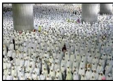
People in White Robes

Revelation 7:1, 3-4, 9, 13-17 And after these things I saw four angels standing on the four corners of the earth, holding the four winds of the earth, that the wind should not blow on the earth, nor on the sea, nor on any tree. 3 Saying, Hurt not the earth, neither the sea, nor the trees, till we have sealed the servants of our God in their foreheads. (4) And I heard the number of them which were sealed: [and there were] sealed an hundred [and] forty [and] four thousand of all the tribes of the children of Israel. 9 After this I beheld, and, lo, a great multitude, which no man could number, of all nations, and kindreds, and people, and