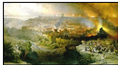
Fall of Jerusalem in 70 AD

Luke 19:41-44 And when he was come near, he beheld the city, and wept over it, (42) Saying, If thou hadst known, even thou, at least in this thy day, the things [which belong] unto thy peace! but now they are hid from thine eyes. (43) For the days shall come upon thee, that thine enemies shall cast a trench about thee, and compass thee round, and keep thee in on every side, (44) And shall lay thee even with the ground, and thy children within thee; and they shall not leave in thee one stone upon another; because thou knewest not the time of thy visitation.