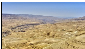
The Jordan (Arnon) Desert