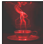
Depiction of God's Cup of Fury