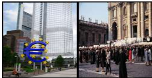
The European Union (Temporal head) & The Roman [Babylon, the great] Catholic Church (Religious head)