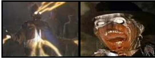
Eyes and flesh consuming away