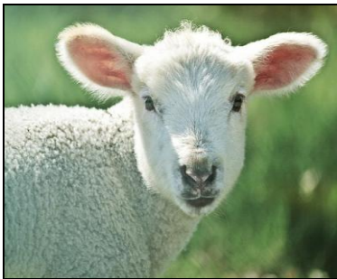
He Lamb without blemish

Isaiah 46:9-10 Remember the former things of old: for I am God, and there is none else; I am God, and there is none like me, (10) Declaring the end from the beginning, and from ancient times the things that are not yet done, saying, My counsel shall stand, and I will do all my pleasure: