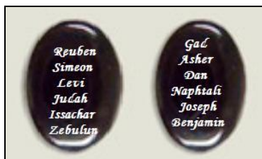
Two Onyx Stones

Exodus 28:1-4, 9-16, 21, 28-29 And take thou unto thee Aaron thy brother, and his sons with him, from among the children of Israel, that he may minister unto me in the priest's office, [even] Aaron, Nadab and Abihu, Eleazar and Ithamar, Aaron's sons. (2) And thou shalt make holy garments for Aaron thy brother for glory and for beauty. (3) And thou shalt speak unto all [that are] wise hearted, whom I have