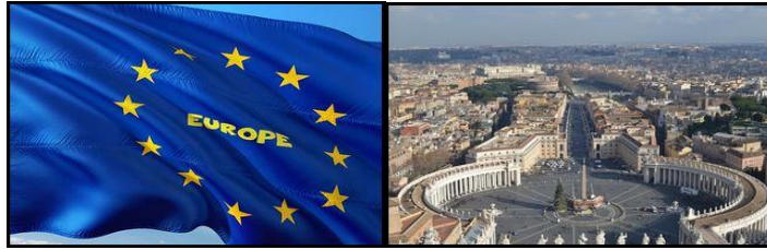
The European Union (Temporal head) & The Roman [Babylon, the great] Catholic Church (Religious head)