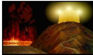
Lake of fire & the Mountain of God

Micah 4:1-4, 6-8 But in the last days it shall come to pass, that the mountain of the house of the LORD shall be established in the top of the mountains, and it shall be exalted above the hills; and people shall flow unto it. (2) And many nations shall come, and say, Come, and let us go up to the mountain of the LORD, and to the house of the God of Jacob; and he will teach us of his ways, and we will walk in his paths: for the law shall go forth of Zion, and the word of the LORD from Jerusalem. (3) And he shall judge among many people, and rebuke strong nations afar off; and they shall beat their swords into plowshares, and their spears into pruninghooks: nation shall not lift up a sword against nation, neither shall they learn war any more. (4) But they shall sit every man under his vine and under his fig tree; and none shall make them afraid: for the mouth of the LORD of hosts hath spoken it . 6 In that day, saith the LORD, will I assemble her that halteth, and I will gather her that is driven out, and her that I have afflicted; (7) And I will make her that halted a remnant, and her that was cast far off a strong nation: and the LORD shall reign over them in mount Zion from henceforth, even for ever. (8) And thou, O tower of the flock, the strong hold of the daughter of Zion, unto thee shall it come, even the first dominion; the kingdom shall come to the daughter of Jerusalem.