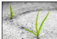
Seeds on Stony Ground

Mark 4:16-17 And these are they likewise which are sown on stony ground; who, when they have heard the word, immediately receive it with gladness; (17) And have no root in themselves, and so endure but for a time: afterward, when affliction or persecution ariseth for the word's sake, immediately they are offended.