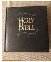
Wisdom/Word of God