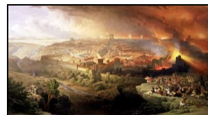
Destruction of Jerusalem in 70 AD

Amos 2:4-7, 9-12 Thus saith the LORD; For three transgressions of Judah, and for four, I will not turn away the punishment thereof; because they have despised the law of the LORD, and have not kept his