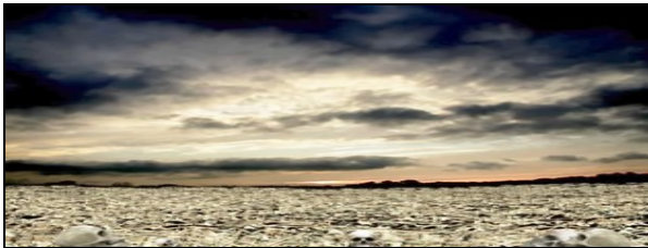
Valley of Dry Bones

Prayer: Isaiah 44:23-25 , 21 Sing, O ye heavens; for the LORD hath done it : shout, ye lower parts of the earth: break forth into singing, ye mountains, O forest, and every tree therein: for the LORD hath redeemed Jacob, and glorified himself in Israel. [24] Thus saith the LORD, thy redeemer, and he that formed thee from the womb, I am the LORD that maketh all things ; that stretcheth forth the heavens alone; that spreadeth abroad the earth by myself; [25] That frustrateth the tokens of the liars, and maketh diviners mad; that turneth wise men backward, and maketh their knowledge foolish; 21 Remember these, O Jacob and Israel; for thou art my servant: I have formed thee; thou art my servant: O Israel, thou shalt not be forgotten of me.