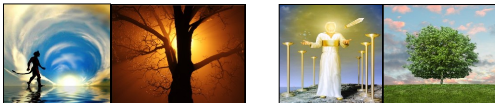
Depiction of the Tree of Knowledge of Good & Evil AND the Tree of Life

Genesis 2:8-9, 16-17 And the LORD God planted a garden eastward in Eden; and there he put the man whom he had formed. (9) And out of the ground made the LORD God to grow every tree that is pleasant to the sight, and good for food; the tree of life also in the midst of the garden, and the tree of knowledge of good and evil. [16] And the LORD God commanded the man, saying, Of every tree of the garden thou mayest freely eat: (17) But of the tree of the knowledge of good and evil, thou shalt not eat of it: for in the day that thou eatest thereof thou shalt surely die.