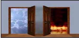
Salvation or Damnation

Matthew 7:13-16, 20-23 Enter ye in at the strait gate: for wide is the gate, and broad is the way, that leadeth to destruction, and many there be which go in thereat: (14) Because strait is the gate, and narrow is the way, which leadeth unto life, and few there be that find it. (15) Beware of false prophets, which come to you in sheep's clothing, but inwardly they are ravening wolves. (16) Ye shall know them by their fruits. Do men gather grapes of thorns, or figs of thistles? 20 Wherefore by their fruits ye shall know them. (21) Not every one that saith unto me, Lord, Lord, shall enter into the kingdom of heaven; but he that doeth the will of my Father which is in heaven. (22) Many will say to me in that day, Lord, Lord, have we not prophesied in thy name? and in thy name have cast out devils? and in thy name done many wonderful works? (23) And then will I profess unto them, I never knew you: depart from me, ye that work iniquity.