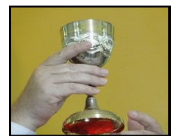
Cup of the Dragon

1 Corinthians 10:16-21 The cup of blessing which we bless, is it not the communion of the blood of Christ? The bread which we break, is it not the communion of the body of Christ? (17) For we being many are one bread, and one body: for we are all partakers of that one bread. (18) Behold Israel after the flesh: are not they which eat of the sacrifices partakers of the altar? (19) What say I then? that the idol is any thing, or that which is offered in sacrifice to idols is any thing? (20) But I say, that the things which the Gentiles sacrifice, they sacrifice to devils, and