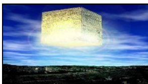
Tabernacle of God

Revelation 21:1-4, 10-12, 23-27 And I saw a new heaven and a new earth: for the first heaven and the first earth were passed away; and there was no more sea. (2) And I John saw the holy city, new Jerusalem, coming down from God out of heaven, prepared as a bride adorned for her husband. (3) And I heard a great voice out of heaven saying, Behold, the tabernacle of God is with men, and he will dwell with them, and they shall be his people, and God himself shall be with them, and be their God. (4) And God shall wipe away all tears from their eyes; and there shall be no more death, neither sorrow, nor crying, neither shall there be any more pain: for the former things are passed away. [10] And he carried me away in the spirit to a great and high mountain, and shewed me that great city, the holy Jerusalem, descending out of heaven from God, (11) Having the glory of God: and her light was like unto a stone most precious, even like a jasper stone, clear as crystal; (12) And had a wall great and high, and had twelve gates, and at the gates twelve angels, and names written thereon, which are the names of the twelve tribes of the children of Israel: [23] And the city had no need of the sun, neither of the moon, to shine in it: for the glory of God did lighten it, and the Lamb