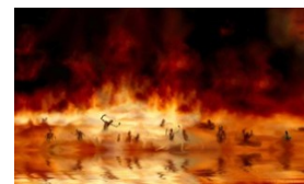
Lake of Fire

Isaiah 14:12-15 How art thou fallen from heaven, O Lucifer, son of the morning! [how] art thou cut down to the ground, which didst weaken the nations! (13) For thou hast said in thine heart, I will ascend into heaven, I will exalt my throne above the stars of God: I will sit also upon the mount of the congregation, in the sides of the north: (14) I will ascend above the heights of the clouds; I will be like the most High. (15) Yet thou shalt be brought down to hell, to the sides of the pit.