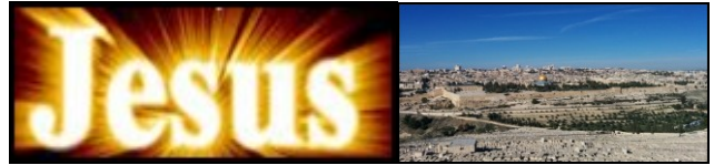
Mount of Olives

Zechariah 14:1-5 Behold, the day of the LORD cometh, and thy spoil shall be divided in the midst of thee. (2) For I will gather all nations against Jerusalem to battle; and the city shall be taken, and the houses rifled, and the women ravished; and half of the city shall go forth into captivity, and the residue of the people shall not be cut off from the city. (3) Then shall the LORD go forth, and fight against those nations, as when he fought in the day of battle. (4) And his feet shall stand in that day upon the mount of Olives, which [is] before Jerusalem on the east, and the mount of Olives shall cleave in the midst thereof toward the east and toward the west, [and there shall be] a very great valley; and half of the mountain shall remove toward the north, and half of it toward the south. (5) And ye shall flee [to] the valley of the mountains; for the valley of the mountains shall reach unto Azal: yea, ye shall flee, like as ye fled from before the earthquake in the days of Uzziah king of Judah: and the LORD my God shall come, [and] all the saints with thee.