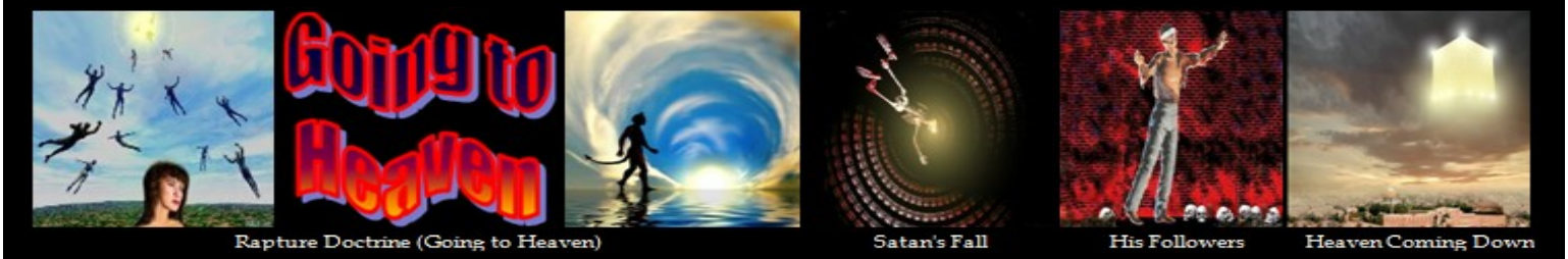
Rapture Doctrine (Going to Heaven)