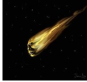
Satan, falling like lightening from Heaven