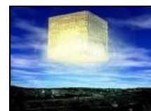
Depiction of New Jerusalem

Revelation 21:1-4 And I saw a new heaven and a new earth: for the first heaven and the first earth were passed away; and there was no more sea. (2) And I John saw the holy city, new Jerusalem, coming down from God out of heaven, prepared as a bride adorned for her husband.