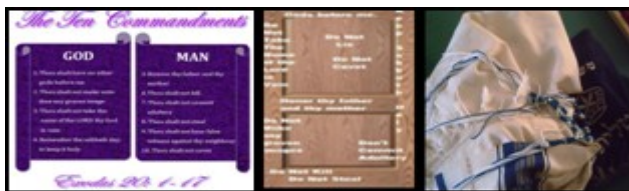
The Law written on doorposts & fringes

An agreement made with two or more parties