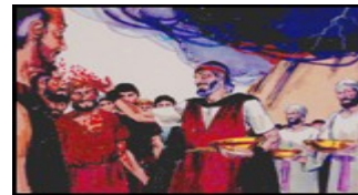
Sprinkling of blood

Exodus 24:3-8 And Moses came and told the people all the words of the LORD, and all the judgments: and all the people answered with one voice, and said, All the words which the LORD hath said will we do. (4) And Moses wrote all the words of the LORD, and rose up early in the morning, and builded an altar under the hill, and twelve pillars, according to the twelve tribes of Israel. (5) And he sent young men of the children of Israel, which offered burnt offerings, and sacrificed peace offerings of oxen unto the LORD. (6) And Moses took half of the blood, and put it in basons; and half of the blood he sprinkled on the altar. (7) And he took the book of the covenant, and read in the audience of the people: and they said, All that the LORD hath said will we do, and be obedient.