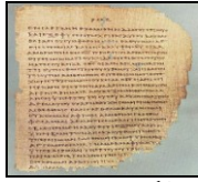
The New Testament (Covenant)

Matthew 26:17-19, 26-28 Now the first day of the feast of unleavened bread the disciples came to Jesus, saying unto him, Where wilt thou that we prepare for thee to eat the passover? (18) And he said, Go into the city to such a man, and say unto him, The Master saith, My time is at hand; I will keep the passover at thy house with my disciples. (19) And the disciples did as Jesus had appointed them; and they made ready the passover. 26 And as they were eating, Jesus took bread, and blessed it , and brake it , and gave it to the disciples, and said, Take, eat; this is my body. (27) And he took the cup, and gave thanks, and gave it to them, saying, Drink ye all of it; (28) For this is my blood of the new testament, which is shed for many for the remission of sins.