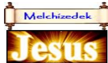
Priest of the Most High God

Galatians 3:6-9, 13-18 Even as Abraham believed God, and it was accounted to him for righteousness. (7) Know ye therefore that they which are of faith, the same are the children of Abraham. (8) And the scripture, foreseeing that God would justify the heathen through faith, preached before the gospel unto Abraham, saying , In thee shall all nations be blessed. (9) So then they which be of faith are blessed with faithful Abraham. [13] Christ hath redeemed us from the curse of the law, being made a curse for us: for it is written, Cursed is every one that hangeth on a tree: (14) That the blessing of Abraham might come on the Gentiles through Jesus Christ; that we might receive the promise of the Spirit through faith. (15)