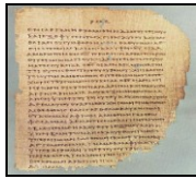
The New Testament (Covenant)

Matthew 26:17-19, 26-28 Now the first day of the feast of unleavened bread the disciples came to Jesus, saying unto him, Where wilt thou that we prepare for thee to eat the passover? (18) And he said, Go into the city to such a man, and say unto him, The Master saith, My time is at hand; I will keep the passover at thy house with my disciples. (19) And the disciples did as Jesus had appointed them; and they made ready the passover. [26] And as they were eating, Jesus took bread, and blessed it , and brake it , and gave it to the disciples, and said, Take, eat; this is my body. (27) And he took the cup, and gave thanks, and gave it to them, saying, Drink ye all of it; (28) For this is my blood of the new testament, which is shed for many for the remission of sins.