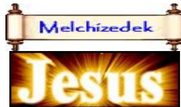
Priest of the Most High God

Galatians 3:6-9, 13-18 Even as Abraham believed God, and it was accounted to him for righteousness. (7) Know ye therefore that they which are of faith, the same are the children of Abraham. (8) And the scripture, foreseeing that God would justify the heathen through faith, preached before the gospel unto Abraham, saying , In thee shall all nations be blessed. (9) So then they which be of faith are blessed with faithful Abraham. [13] Christ hath redeemed us from the curse of the law, being made a curse for us: for it is written, Cursed is every one that hangeth on a tree: (14) That the blessing of Abraham might come on the Gentiles through Jesus Christ; that we might receive the promise of the Spirit through faith. (15)