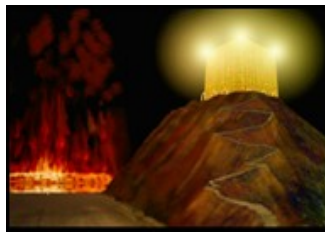
Lake of fire & the Mountain of God/New Jerusalem