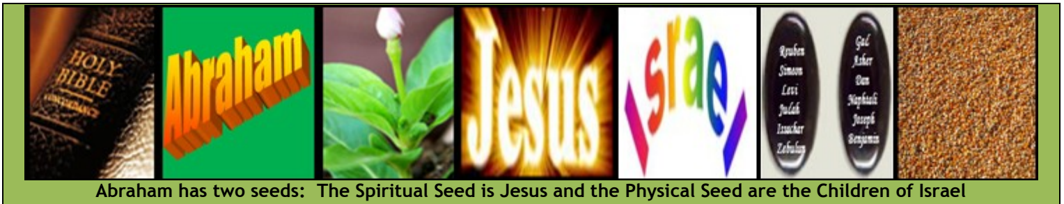
Abraham has two seeds: The Spiritual Seed is Jesus and the Physical Seed are the Children of Israel

Prayer: Psalms 119:169-176 Let my cry come near before thee, O LORD; give me understanding according to thy word. (170) Let my supplication come before thee: deliver me according to thy word. (171) My lips shall utter praise, when thou hast taught me thy statutes. (172) My tongue shall speak of thy word: for all thy commandments are righteousness. (173) Let thine hand help me; for I have chosen thy precepts. (174) I have longed for thy salvation, O LORD; and thy law is my delight. (175) Let my soul live, and it shall praise thee; and let thy judgments help me. (176) I have gone astray like a lost sheep; seek thy servant; for I do not forget thy commandments.