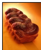
Puffed up = Old Leaven (Sin)