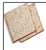
Flat = Unleavened (Without Sin)

1 Corinthians 5:7 Purge out therefore the old leaven, that ye may be a new lump, as ye are unleavened. For even Christ our passover is sacrificed for us: