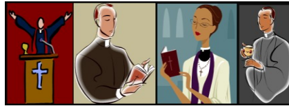
Modern day scribes & Pharisees

Matthew 23:15 Woe unto you, scribes and Pharisees, hypocrites! for ye compass sea and land to make one proselyte, and when he is made, ye make him twofold more the child of hell than yourselves.