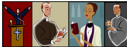
Modern day scribes & Pharisees

Matthew 23:15 Woe unto you, scribes and Pharisees, hypocrites! for ye compass sea and land to make one proselyte, and when he is made, ye make him twofold more the child of hell than yourselves.