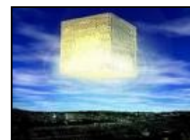
Depiction of New Jerusalem

Revelation 21:1-6, 24 And I saw a new heaven and a new earth: for the first heaven and the first earth were passed away; and there was no more sea. (2) And I John saw the holy city, new Jerusalem, coming down from God out of heaven, prepared as a bride adorned for her husband. (3) And I heard a great voice out of heaven saying, Behold, the tabernacle of God is with men, and he will dwell with them, and they shall be his people, and God himself shall be with them, and be their God. (4) And God shall wipe away all tears from their eyes; and there shall be no more death, neither sorrow, nor crying, neither shall there be any more pain: for the former things are passed away. (5) And he that sat upon the throne said, Behold, I make all things new. And he said unto me, Write: for these words are true and faithful. (6) And he said unto me, It is done. I am Alpha and Omega, the beginning and the end. I will give unto him that is athirst of the fountain of the water of life freely. [24] And the nations of them which are saved shall walk in the light of it: and the kings of the earth do bring their glory and honour into it.