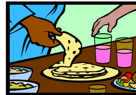
Drinking & Partying

Isaiah 5:11-14 Woe unto them that rise up early in the morning, [that] they may follow strong drink; that continue until night, [till] wine inflame them! (12) And the harp, and the viol, the tabret, and pipe, and wine, are in their feasts: but they regard not the work of the LORD, neither consider the operation of his hands. (13) Therefore my people are gone into captivity, because [they have] no knowledge: and their honourable men [are] famished, and their multitude dried up with thirst. (4) Therefore hell hath enlarged herself, and opened her mouth without measure: and their glory, and their multitude, and their pomp, and he that rejoiceth, shall descend into it.