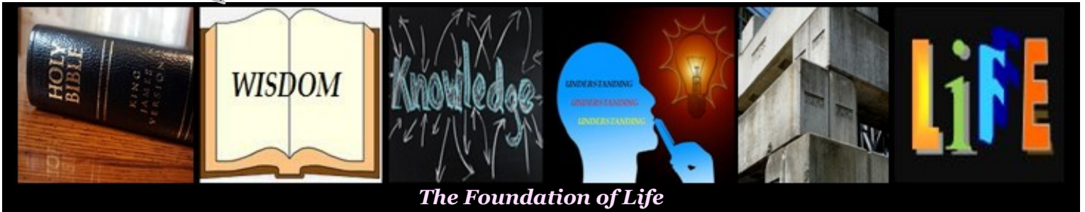
The Foundation of Life

Prayer: Nahum 1:5-7 The mountains quake at him, and the hills melt, and the earth is burned at his presence, yea, the world, and all that dwell therein. (6) Who can stand before his indignation? and who can abide in the fierceness of his anger? his fury is poured out like fire, and the rocks are thrown down by him. (7) The LORD is good, a strong hold in the day of trouble; and he knoweth them that trust in him.