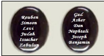
Two Onyx Stones