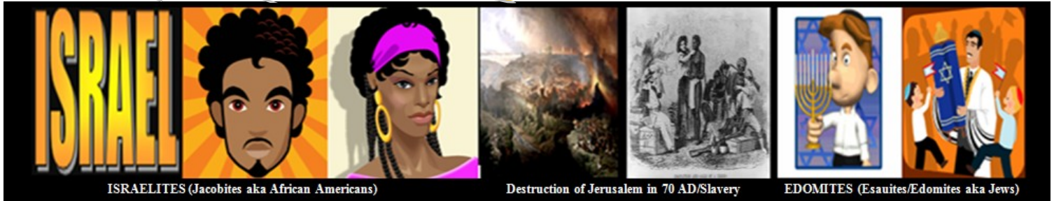
ISRAELITES (Jacobites aka African Americans)