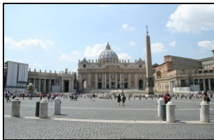
Babylon, the mighty city (The Vatican)

Revelation 17:1-5, 9, 12-14 And there came one of the seven angels which had the seven vials, and talked with me, saying unto me, Come hither; I will shew unto thee the judgment of the great whore that sitteth upon many waters: (2) With whom the kings of the earth have committed fornication, and the inhabitants of the earth have been made drunk with the wine of her fornication. (3) So he carried me away in the spirit