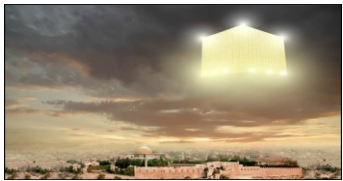
The Kingdom of God coming down

Matthew 6:13 And lead us not into temptation, but deliver us from evil: For thine is the kingdom, and the power, and the glory, for ever. Amen.