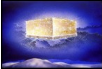
The Holy City, New Jerusalem

Matthew 25:31-34 When the Son of man shall come in his glory, and all the holy angels with him, then shall he sit upon the throne of his glory: (32) And before him shall be gathered all nations: and he shall separate them one from another, as a shepherd divideth [his] sheep from the goats: (33) And he shall set the sheep on his right hand, but the goats on the left. (34) Then shall the King say unto them on his right hand, Come, ye blessed of my Father, inherit the kingdom prepared for you from the foundation of the world: