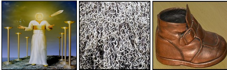
7 Golden Candlesticks

Revelation 12:9 And the great dragon was cast out, that old serpent, called the Devil, and Satan, which deceiveth the whole world: he was cast out into the earth, and his angels were cast out with him.