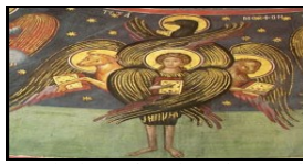
Depiction of a Cherub Angel

Prayer: Psalms 85:1-13 LORD, thou hast been favourable unto thy land: thou hast brought back the captivity of Jacob. (2) Thou hast forgiven the iniquity of thy people, thou hast covered all their sin. Selah. (3) Thou hast taken away all thy wrath: thou hast turned thyself from the fierceness of thine anger. (4) Turn us, O God of our salvation, and cause thine anger toward us to cease. (5) Wilt thou be angry with us for ever? wilt thou draw out thine anger to all generations? (6) Wilt thou not revive us again: that thy people may rejoice in thee? (7) Shew us thy mercy, O LORD, and grant us thy salvation. (8) I will hear what God the LORD will speak: for he will speak peace unto his people, and to his saints: but let them not turn again to folly. (9) Surely his salvation is nigh them that fear him; that glory may dwell in our land. (10) Mercy and truth are met together; righteousness and peace have kissed each other . (11) Truth shall spring out of the earth; and righteousness shall look down from heaven. (12) Yea, the LORD shall give that which is good ; and our land shall yield her increase. (13) Righteousness shall go before him; and shall set us in the way of his steps.