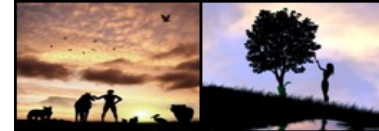
THE FALL OF MAN

Genesis 2:7-9, 16-17 And the LORD God formed man of the dust of the ground, and breathed into his nostrils the breath of life; and man became a living soul. (8) And the LORD God planted a garden eastward in Eden; and there he put the man whom he had formed. (9) And out of the ground made the LORD God to grow every tree that is pleasant to the sight, and good for food; the tree of life also in the midst of the garden, and the tree of knowledge of good and evil. 16 And the LORD God commanded the man, saying, Of every tree of the garden thou mayest freely eat: (17) But of the tree of the knowledge of good and evil, thou shalt not eat of it: for in the day that thou eatest thereof thou shalt surely die.