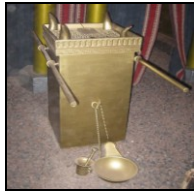
Altar of Incense

Prayer: Psalms 63:1-8 O God, thou art my God; early will I seek thee: my soul thirsteth for thee, my flesh longeth for thee in a dry and thirsty land, where no water is; (2) To see thy power and thy glory, so as I have seen thee in the sanctuary. (3) Because thy lovingkindness is better than life, my lips shall praise thee. (4) Thus will I bless thee while I live: I will lift up my hands in thy name. (5) My soul shall be satisfied as with marrow and fatness; and my mouth shall praise thee with joyful lips: (6) When I remember thee upon my bed, and meditate on thee in the night watches. (7) Because thou hast been my help, therefore in the shadow of thy wings will I rejoice. (8) My soul followeth hard after thee: thy right hand upholdeth me.